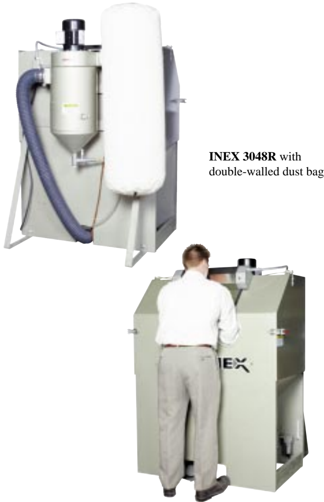
INEX 3048R with double-walled dust bag