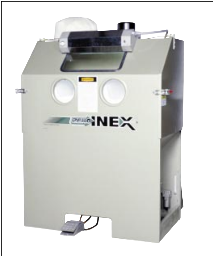
INEX Model 3048R